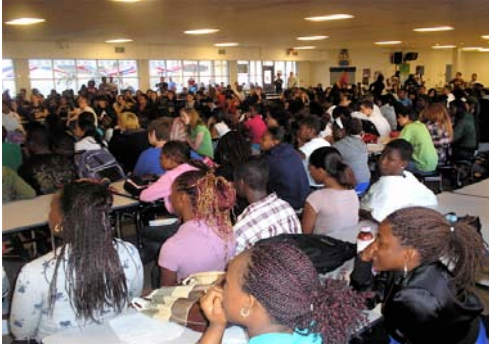
King HS ends its last outreach meeting with over 475 attending a Program featuring The Master's Commission and testimonies.

It has been an amazing school year that is ending with our final Legacy Club outreach meetings. Imagine a small group of about 40 Christian students who had a dream to reach their school for Jesus Christ. They request the Master's Commission to be the main part of the program. They pray for a large crowd. The meeting is moved to the largest area available. And then the day arrived! Over 475 attended and heard the gospel and many made commitments to the Lord. The student leaders and Adult sponsor were ecstatic and thankful that their fellow students and teachers shared in this special event at their school.