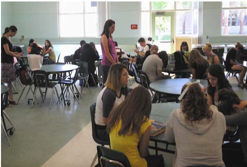
Students pray at Freedom HS meeting.