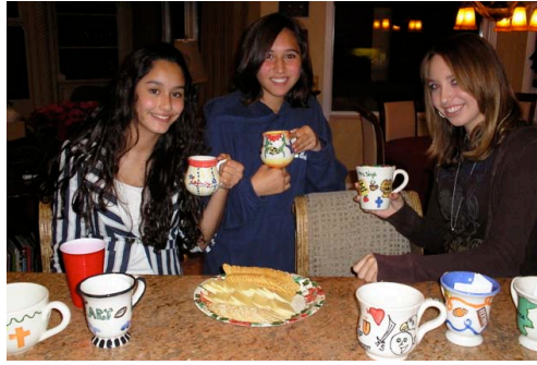
CDS students hand painted ceramic mugs for all their teachers.

Our Legacy Clubs have been finishing the school year strong with various projects. At Carrollwood Day School, the members painted ceramic mugs for all the teachers and presented them on the last day of school. It is acts like these that shows the love of our Lord to the world. At all our schools December ends with exams and final club meetings. We have had a great start with great excitement for the upcoming year. As the world appears chaotic, these students remain focused on sharing their faith and growing in Christ.