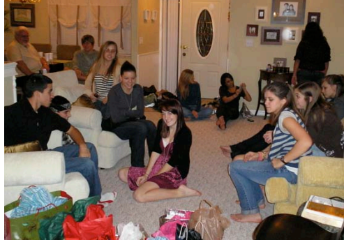
Gaither HS holds a leadership meeting celebrating Christmas together.

Our Legacy Clubs have been finishing the school year strong with various projects. At Carrollwood Day School, the members painted ceramic mugs for all the teachers and presented them on the last day of school. It is acts like these that shows the love of our Lord to the world. At all our schools December ends with exams and final club meetings. We have had a great start with great excitement for the upcoming year. As the world appears chaotic, these students remain focused on sharing their faith and growing in Christ.